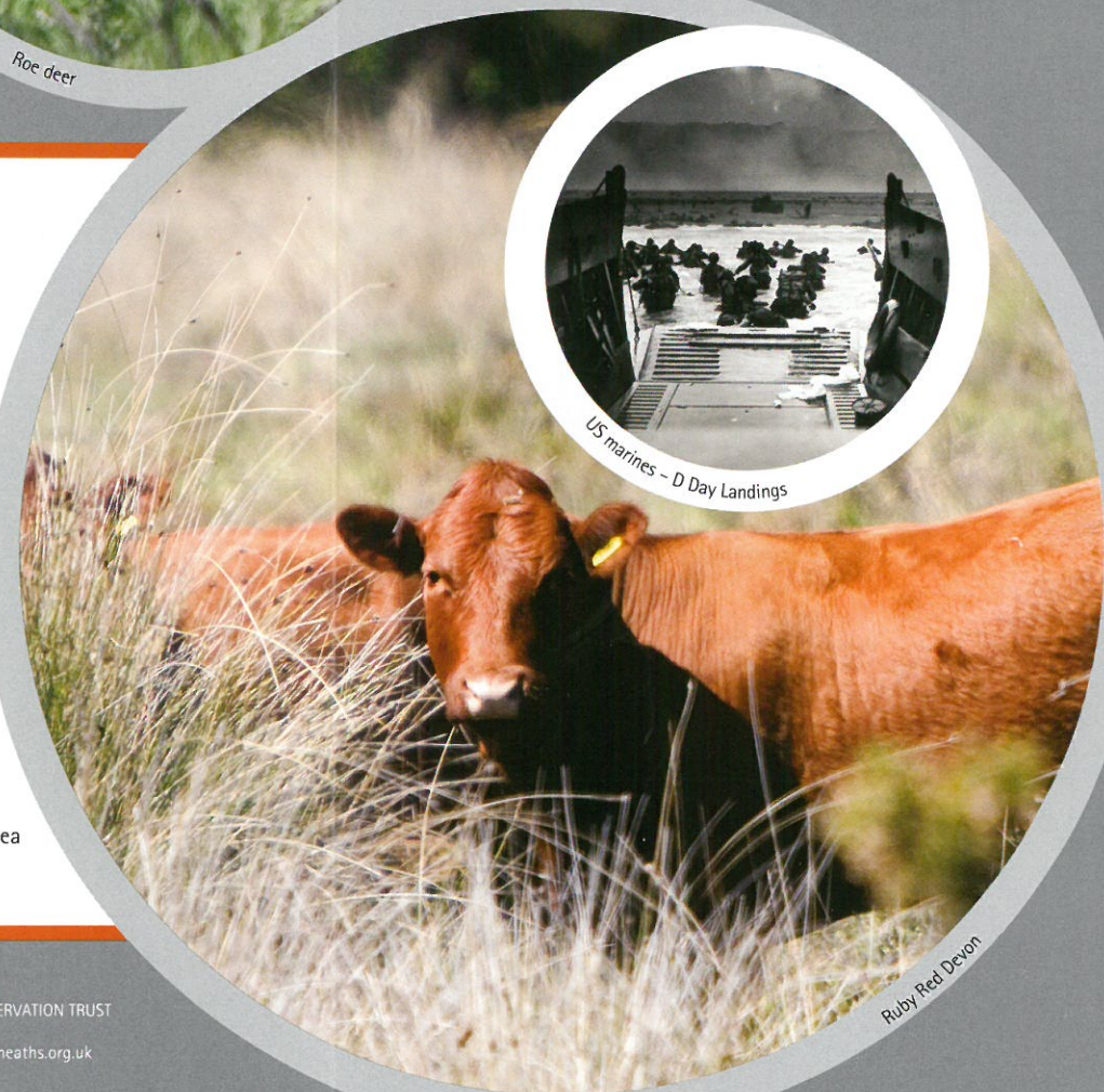
Ruby Red Devon