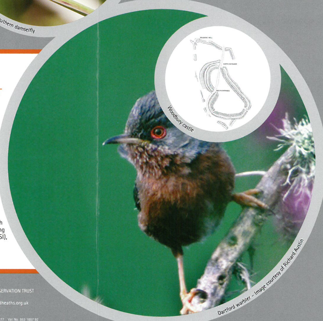
Dartford warbler